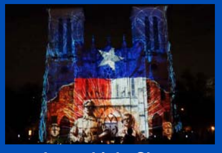
Laser Light Show