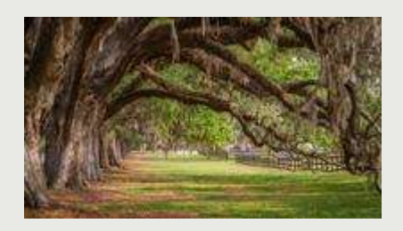
Boone Plantation Charleston