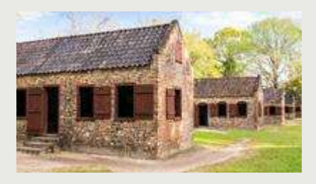
Boone Plantation Charleston