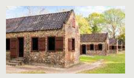
Boone Plantation Charleston