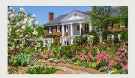
Boone Plantation Charleston