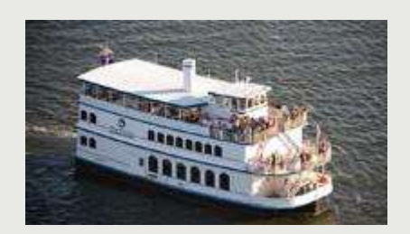
Charleston Dinner Cruise