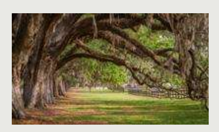
Boone Plantation Charleston