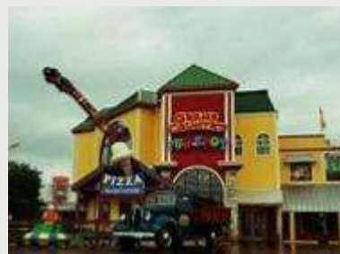
Grand Country Buffet