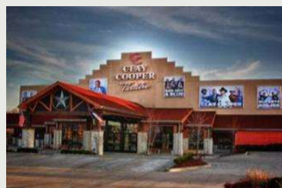
The Clay Cooper Show