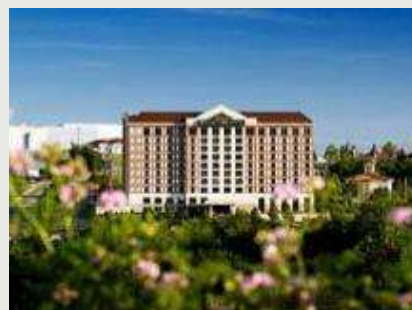
The Grand Plaza Hotel