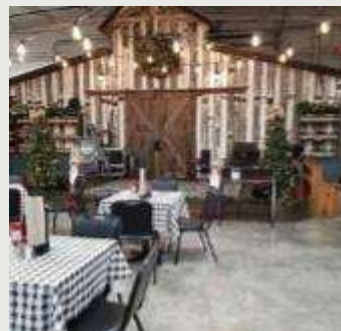
The Pickin' Porch Grill