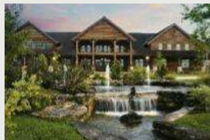
The Keeler Center